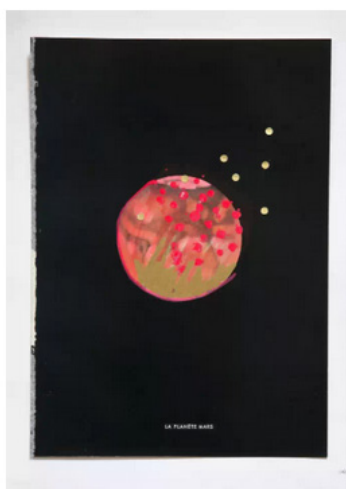
La planète Mars, 2015, Courtesy of Galerie E.G. P, Paris